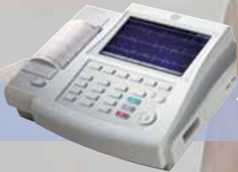
The new MAC* 800